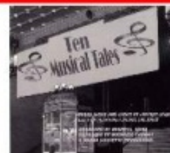
Ten Musical Tales (3CD pack)