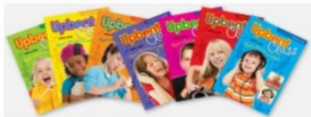
The Components (at each level)

Teachers Book gives families of activities grouped in units of work that highlight each musical concept (Beat, Rhythm, Pitch, Tempo, etc.) Simple, short, teaching ideas with a minimum of reading supported by high-quality instrumental music and excellent vocal models on the 4CD pack make lessons engaging and meaningful. (More than 200 activities per Teacher Book) Evaluation sections at the end of each unit clarify individual and class progress.