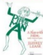
The Piperman (2 CD pack)